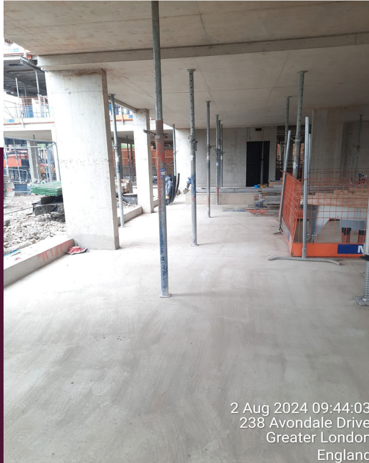
2 Aug 2024 09:44:03 238 Avondale Drive Greater London England