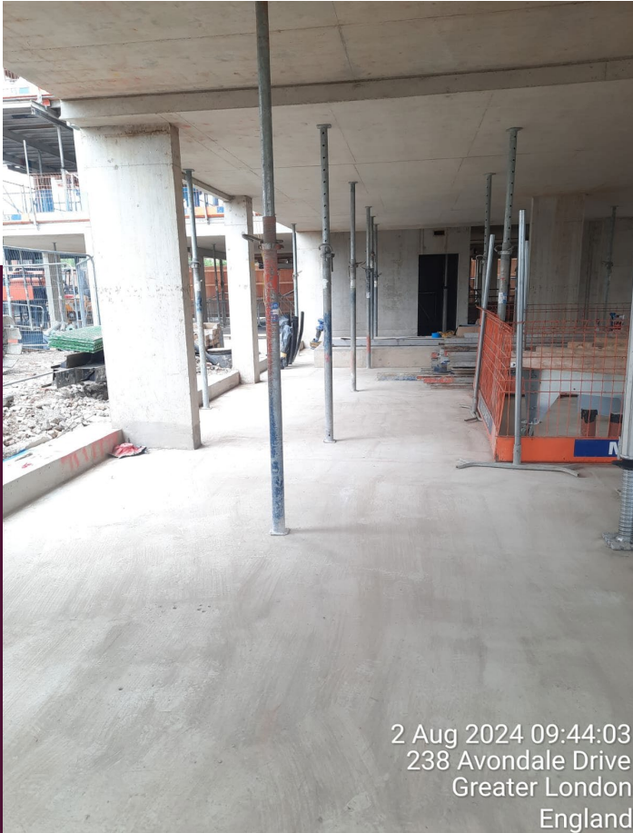
2 Aug 2024 09:44:03 238 Avondale Drive Greater London England