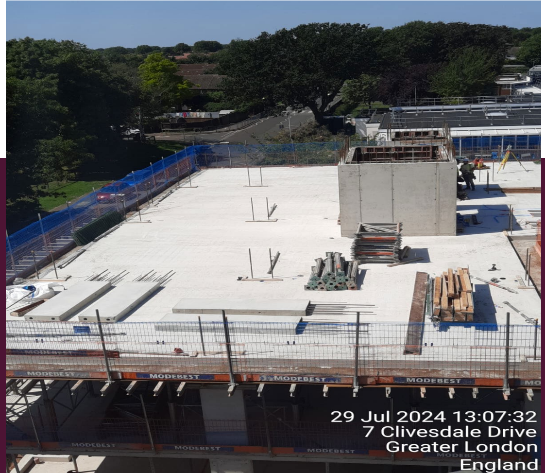
29 Jul 2024 13:07:32 7 Clivesdale Drive Greater London England