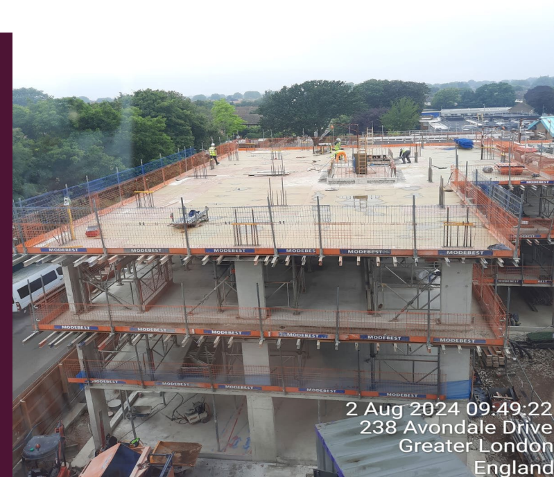
2 Aug 2024 09:49:22 238 Avondale Drive Greater London England