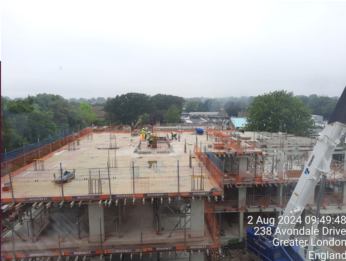
2 Aug 2024 09:49:48 238 Avondale Drive Greater London England