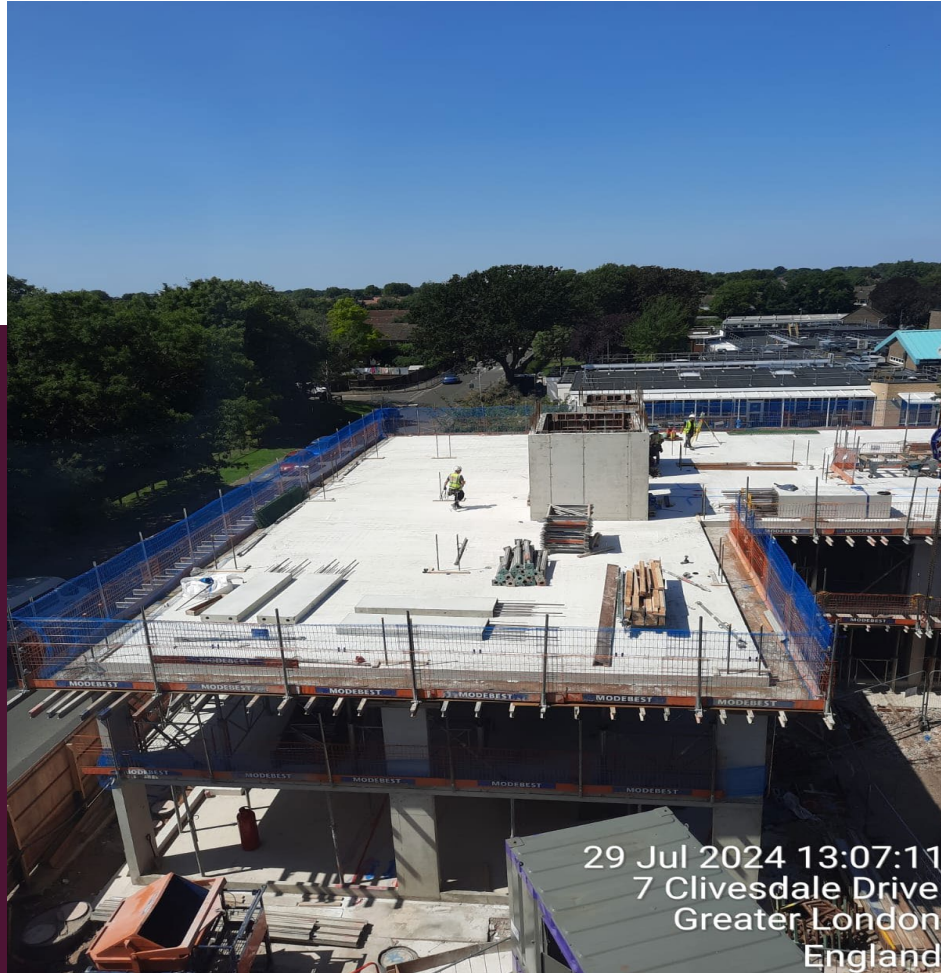
29 Jul 2024 13:07:11 7 Clivesdale Drive Greater London England