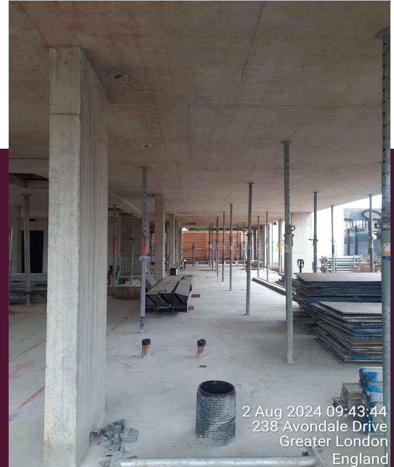
2 Aug 2024 09:43:44 238 Avondale Drive Greater London England