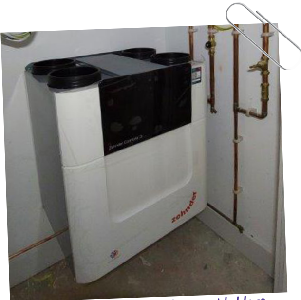
Indicative Mechanical Ventilation with Heat Recovery (MVHR) unit