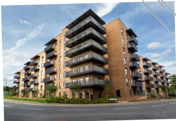
Atlas Lodge, Uxbridge

Atlas Lodge Housing for over 55's is a state-of-the-art modern scheme with energy efficient flats for residents living independently. This development consists of 72 properties for resident age 55 and over. The block is owned and managed by Anchor Housing. Hillingdon residents have 100% nomination rights to move into one of these homes.