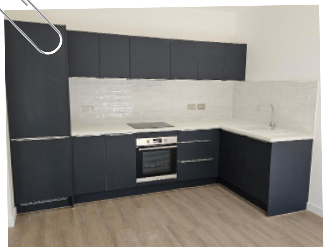
Cavenham Court, Kitchen Layout